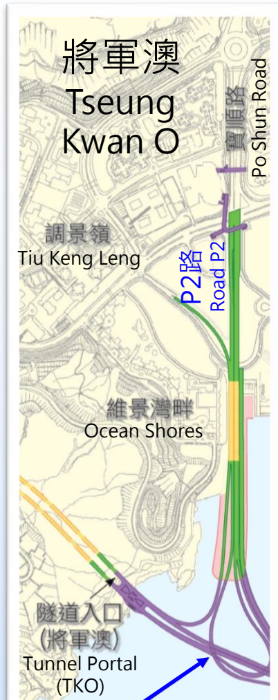
將軍澳交匯處 Tseung Kwan O Interchange